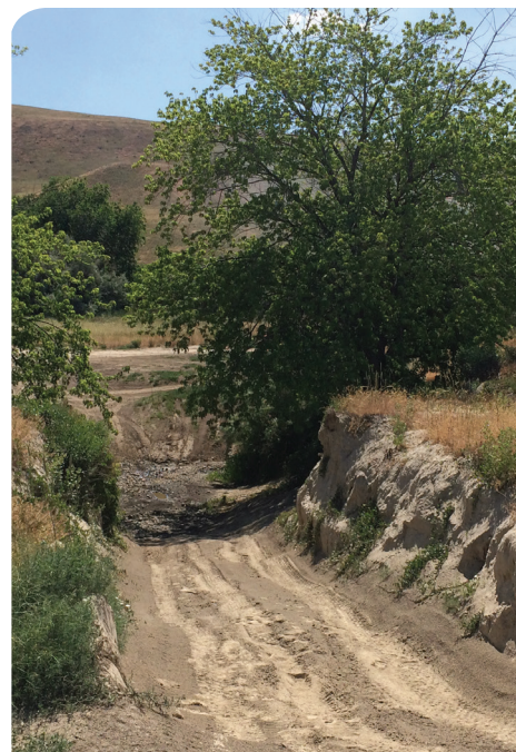
Coccidioides lives in dry, dusty soil. It was recently found in south-central Washington.

Responding to outbreaks and emerging threats is a core part of CDC’s work on fungal diseases. Valley fever sickens thousands of people every year when they inhale the microscopic fungus Coccidioides . Until recently, scientists believed that Coccidioides only lived in soil in the Southwestern United States and parts of Latin America. The fungus was discovered in south-central Washington after several residents developed Valley fever. Samples from one patient and soil from the suspected exposure site were identical by whole genome sequencing, proving that the infection was acquired in Washington. CDC is developing new tools that make it faster and easier to detect Coccidioides in the environment. Those tools will help scientists determine where a person was most likely infected, how strains are related, and which areas could pose a risk – information that is essential for raising awareness about the disease among other public health officials, healthcare providers, and the public.